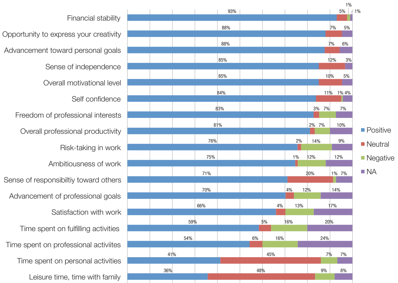
FIGURE 1. FELLOWS' PERCEPTIONS OF THE IMPACT OF THE FELLOWSHIP

The assessment did not attempt to catalogue the post-award accomplishments of individual Fellows or to measure directly the impact of the Fellowship on a specific discipline. Fellows perceive the Fellowship as having the potential to draw attention to a Fellow's area of work, especially in smaller and nascent fields.