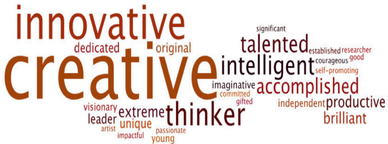
FIGURE 2. PEERS’ PERCEPTIONS OF FELLOWS

Fellows’ peers regard Fellows first and foremost as creative and innovative. They see the Fellowship as distinctive because it prioritizes potential over achievement, compared with other prestigious awards. Simultaneously, they report admiration toward Fellows and their work; however, they are less likely than the engaged public to suggest that the Fellowship has inspired their own pursuit of creative ideas. Figure 2 illustrates the words most associated with Fellows by their peers (words displayed with larger images were more frequently noted).