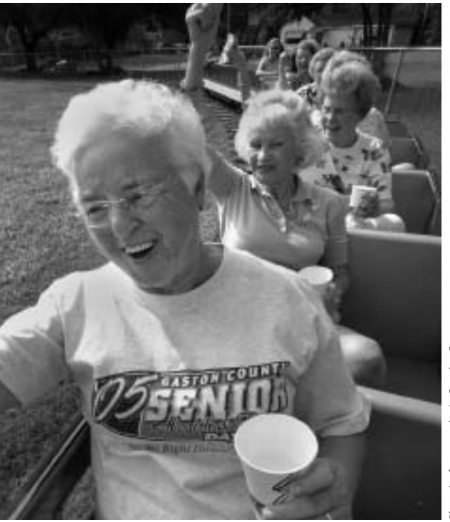
The aging of America presents many oportunities.

educate employees and keep them in the workforce longer? Can we develop more flexible approaches to work schedules and worksite design? Should efforts outside the workforce, such as volunteering, be encouraged in some way? Should winwin approaches that benefit multiple generations, like the South African pension example, be given special incentives? Lack of attention to these issues could prove, in the long run, to be just as damaging as the financial imbalances in entitlements.