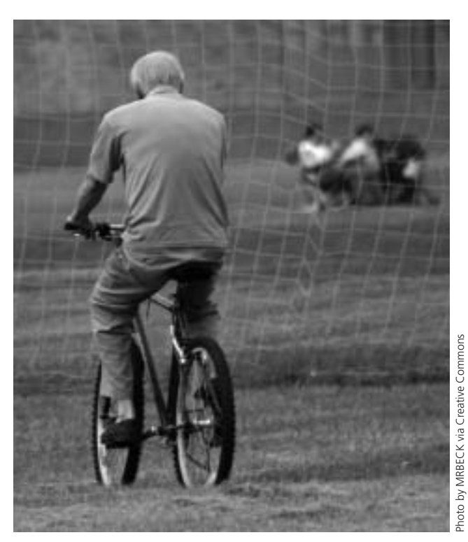
Being old doesn't necessarily entail being frail.

Moreover, surveys of public attitudes in the United States