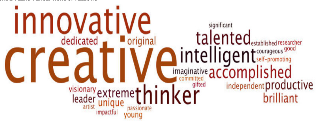
FIGURE 2. PEERS' PERCEPTIONS OF FELLOWS

Fellows' peers regard Fellows first and foremost as creative and innovative. They see the Fellowship as distinctive because it prioritizes potential over achievement, compared with other prestigious awards. Simultaneously, they report admiration toward Fellows and their work; however, they are less likely than the engaged public to suggest that the Fellowship has inspired their own pursuit of creative ideas. Figure 2 illustrates the words most associated with Fellows by their peers (words displayed with larger images were more frequently noted).