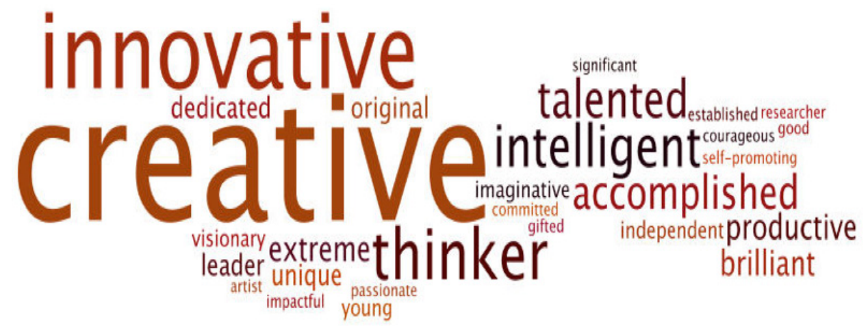
FIGURE 2. PEERS' PERCEPTIONS OF FELLOWS

Fellows' peers regard Fellows first and foremost as creative and innovative. They see the Fellowship as distinctive because it prioritizes potential over achievement, compared with other prestigious awards. Simultaneously, they report admiration toward Fellows and their work; however, they are less likely than the engaged public to suggest that the Fellowship has inspired their own pursuit of creative ideas. Figure 2 illustrates the words most associated with Fellows by their peers (words displayed with larger images were more frequently noted).